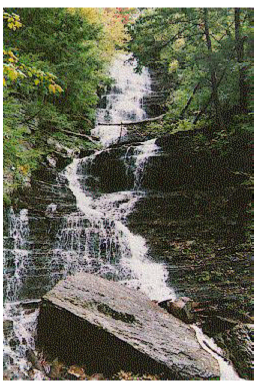
Lye Brook Falls

Approximately 80% of the area is forested with northern hardwoods, including birch, beech, and maple. Thickets of small spruce dot the area, along with remnants of railroad grades and old logging roads.